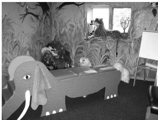
Our pediatric "Jungle Room".

For more information on how chiropractic can benefit the health of children, visit us at www.vaneverychiropractic.com .