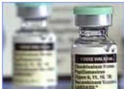
Gardasil, the HPV vaccine created by Merck, is given as three shots over six months.

At least 1,637 Gardasil reactions have been reported to the FDA including at least three deaths, spontaneous abortion and paralysis. Since only 1 in 10 vaccine injuries are usually reported to the FDA, this data may reflect only a fraction of the true number.