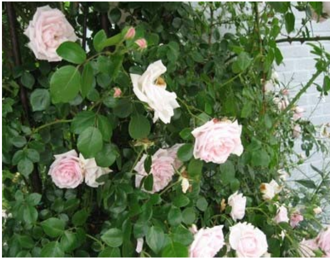
This is a photo of our garden arch at the office.

Welcome to our office's Chiropractic newsletter. Our mission is to work as a dedicated team supporting and educating our community. We encourage better health through Chiropractic with integrity and compassion in a fun, friendly atmosphere.